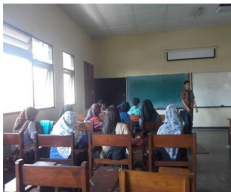
Figure 1. Students share their ideas of TED TALKS material in a class.